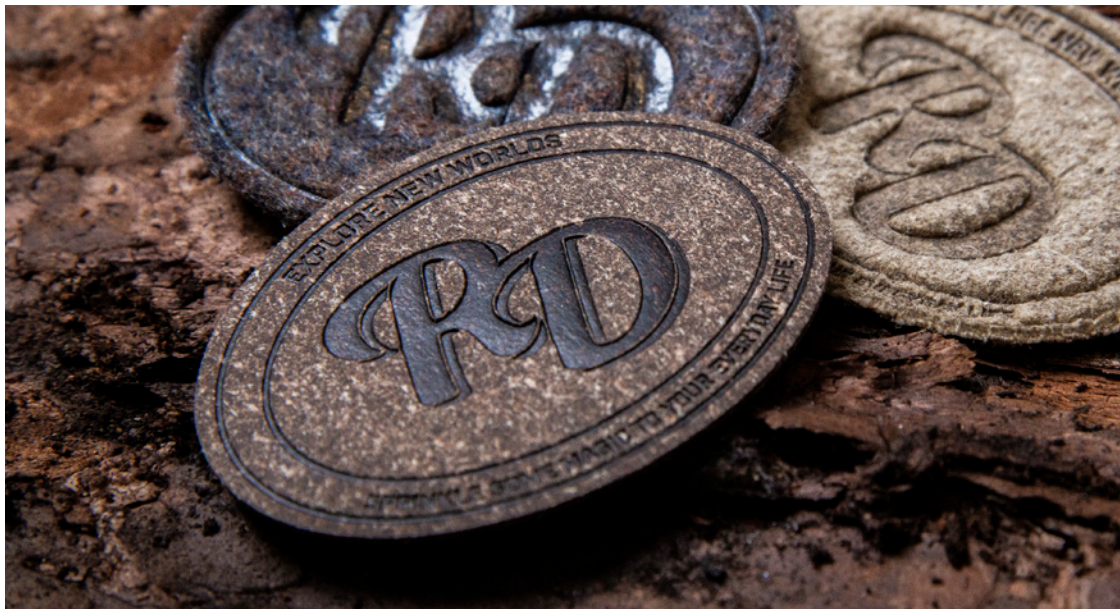
Badge 260500173 - GRS Recycled genuine leather