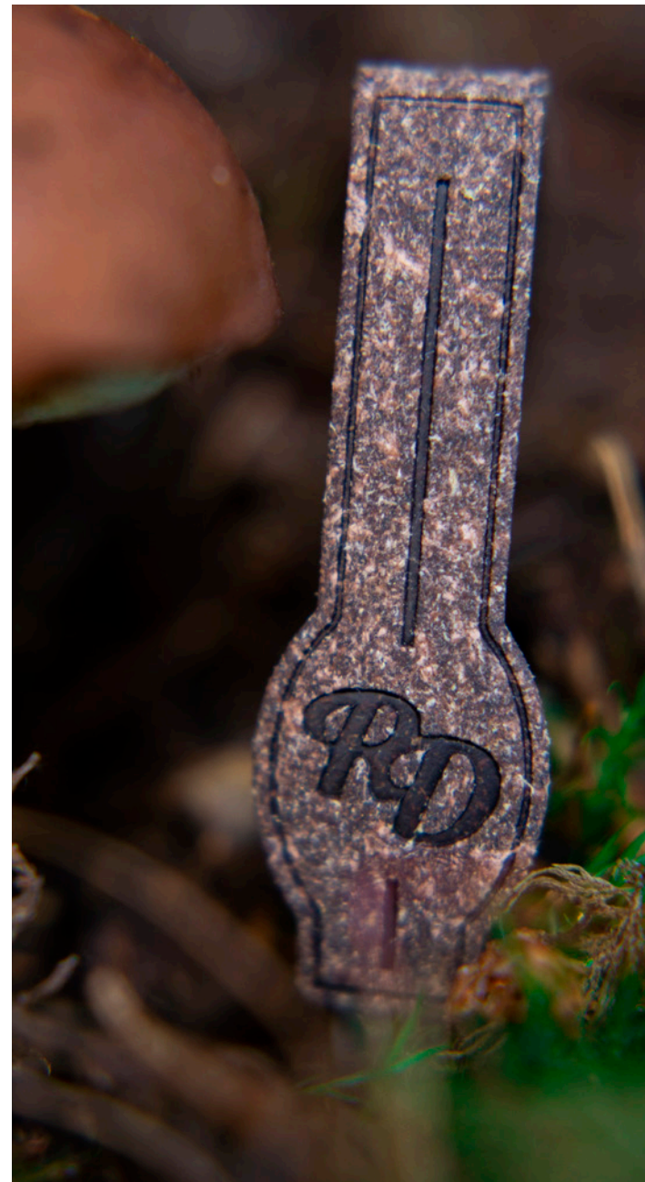
Zippuller 260500172 - GRS Recycled genuine leather