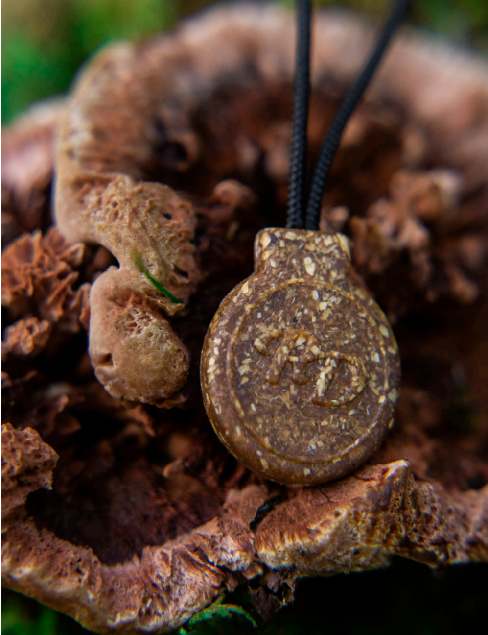
Zippuller 250500104 - Zip puller made in PU with wooden fibers, recycled polyester string.