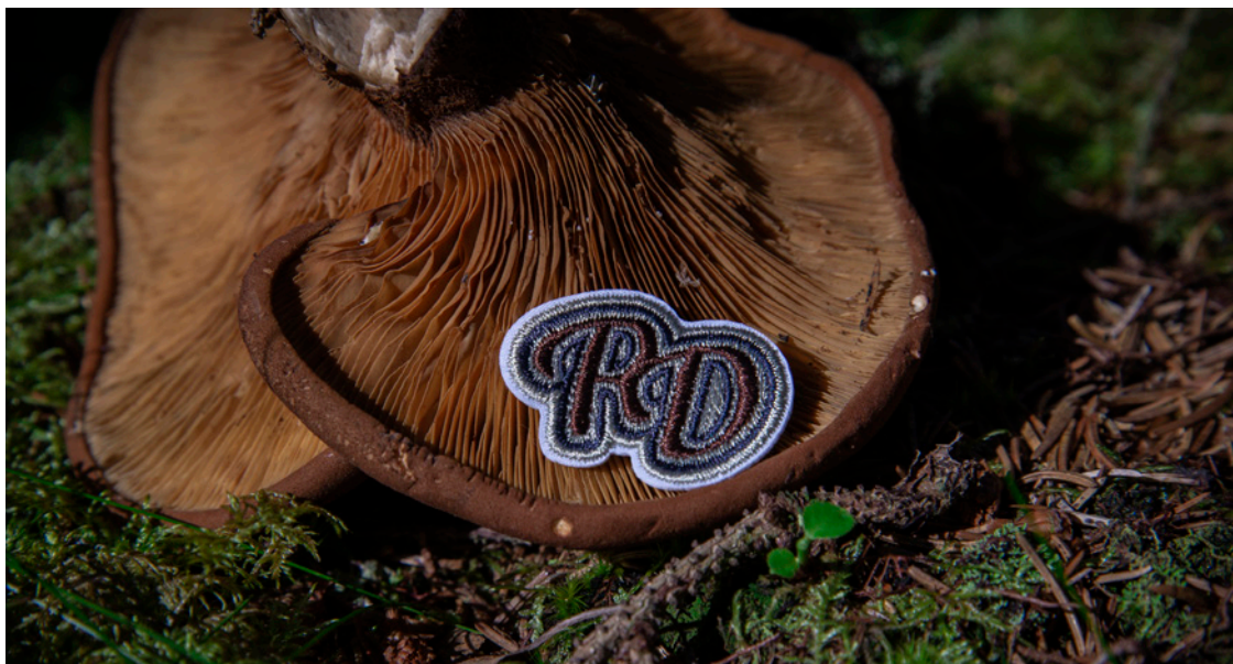
Badge 240100250 - material is recycled polyester