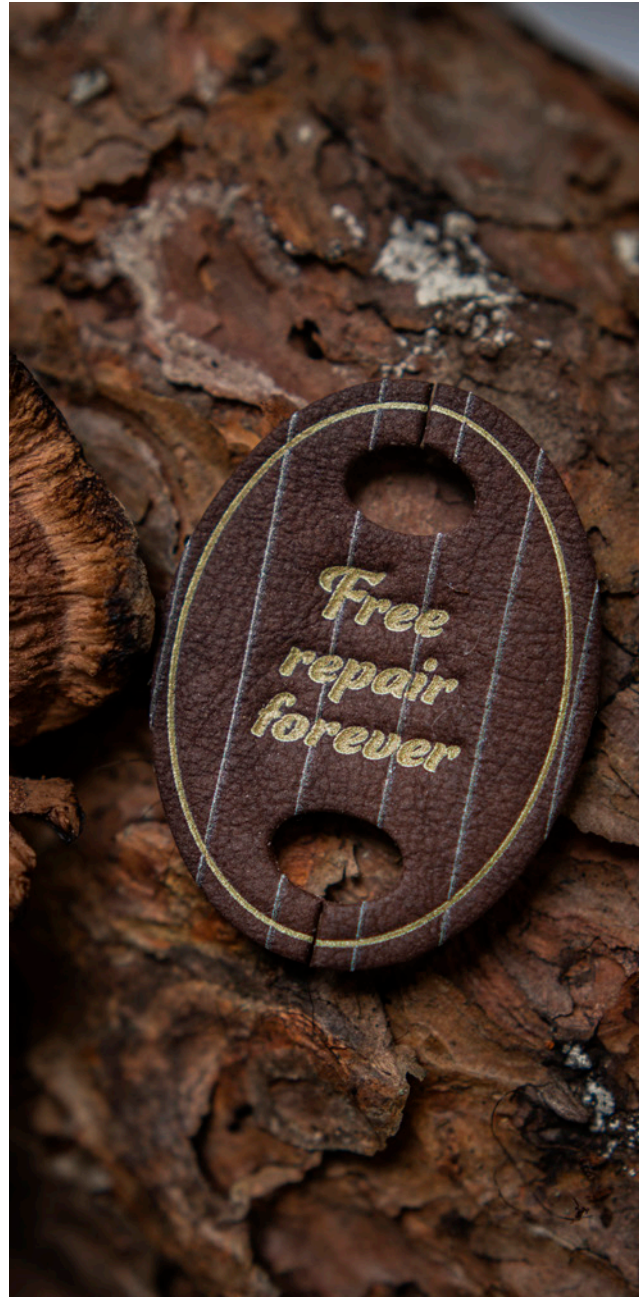
Label 221000113 - jacron