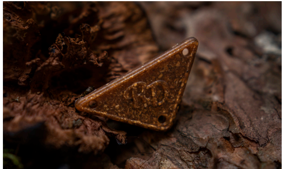
Badge 250800243 - made in PU with wooden fibers.