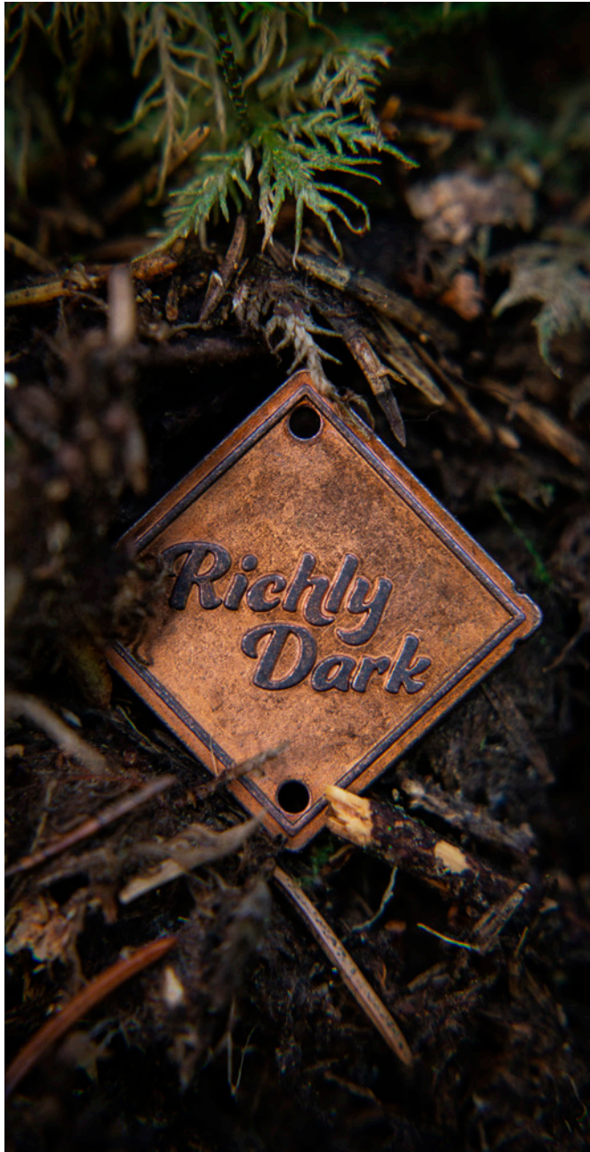
Badge 270100105 - Metal