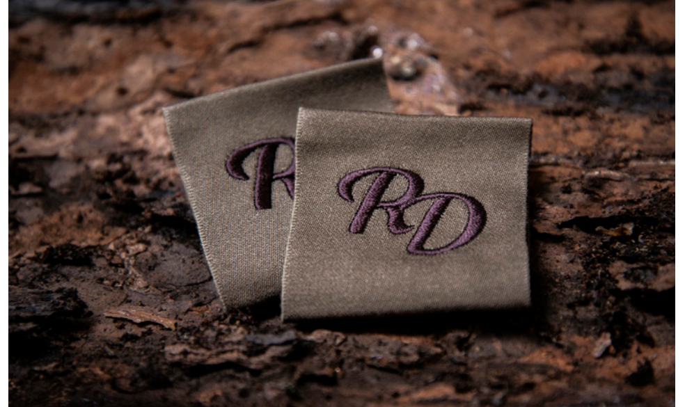
Label 211500145 - Ground lyocell with embroidery in viscose