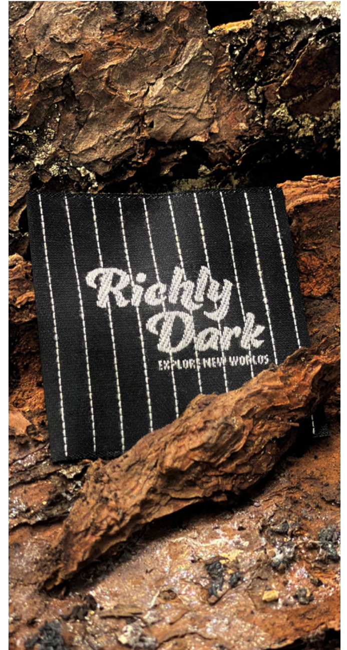
Woven label 100% tencel